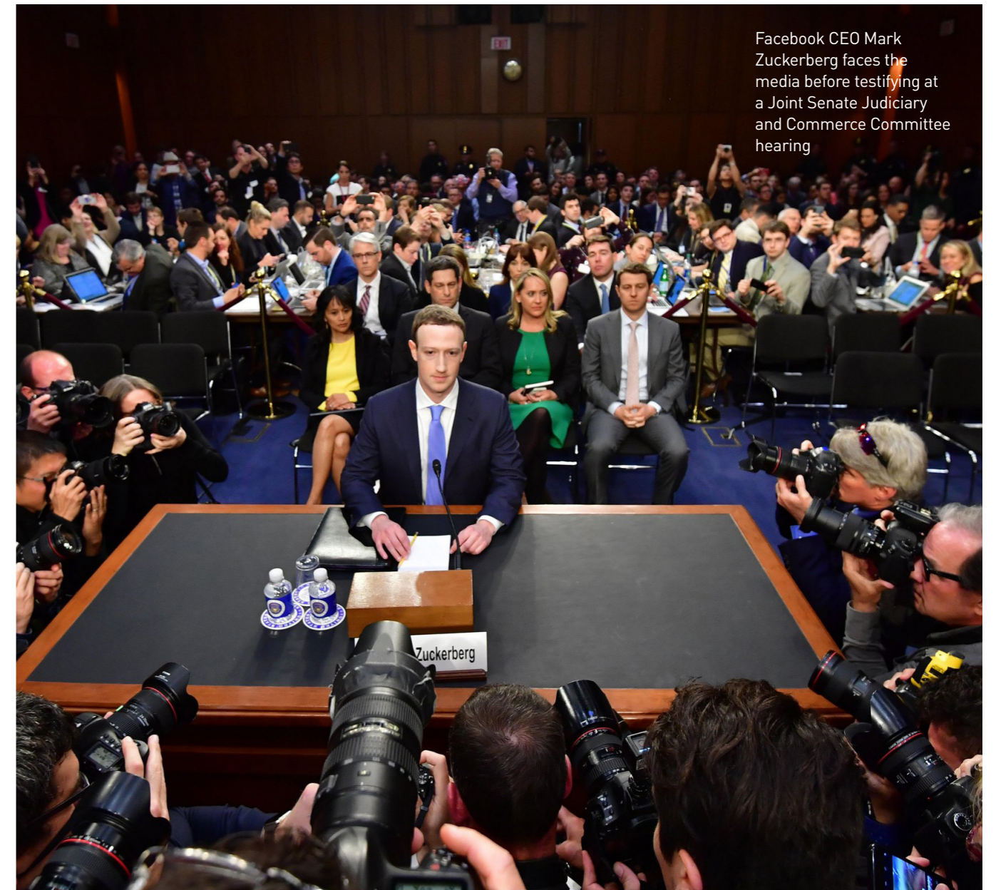
Facebook CEO Mark Zuckerberg faces the media before testifying at a Joint Senate Judiciary and Commerce Committee hearing